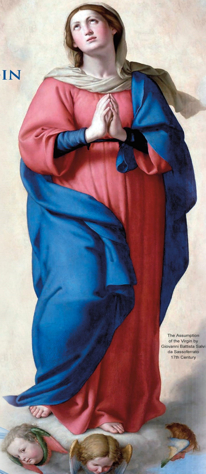
The Assumption of the Virgin by Giovanni Battista Salvi da Sassoferrato 17th Century